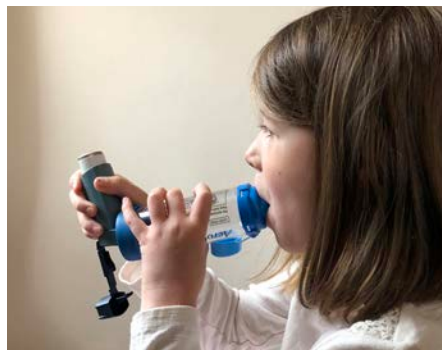
5. Close lips around mouthpiece