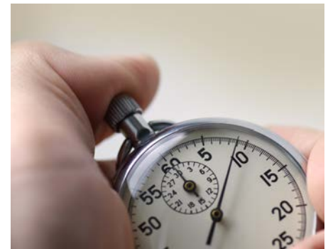
If you need another puff of medicine, wait 1 minute then repeat steps 5-9.