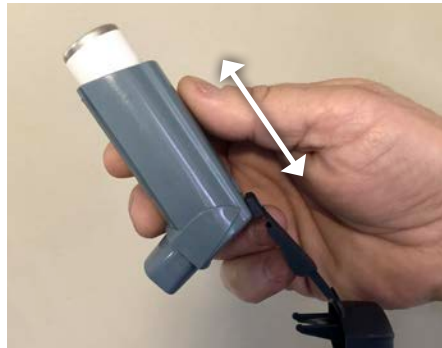
2. Shake the inhaler for 5 seconds