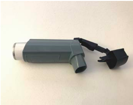
1. Take the cap off the inhaler