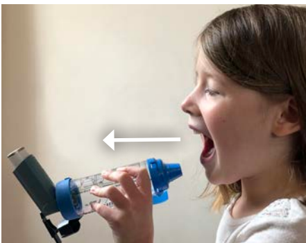
4. Breathe OUT all the way