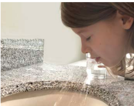
9. Rinse with water and SPIT OUT

For more asthma videos, handouts, tutorials and resources, visit Lung.org/asthma .