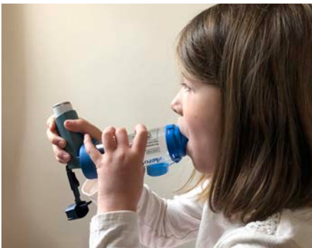
7. Breathe in SLOWLY, DEEPLY