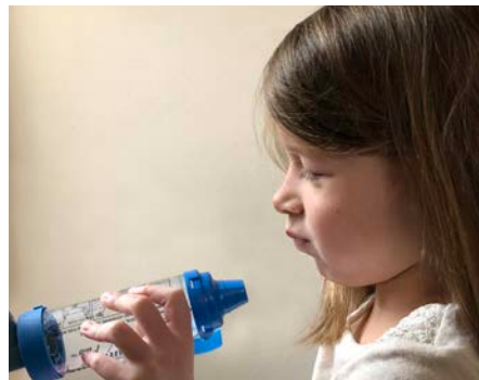
8. Hold your breath for 10 seconds if you can. Then breathe out slowly.