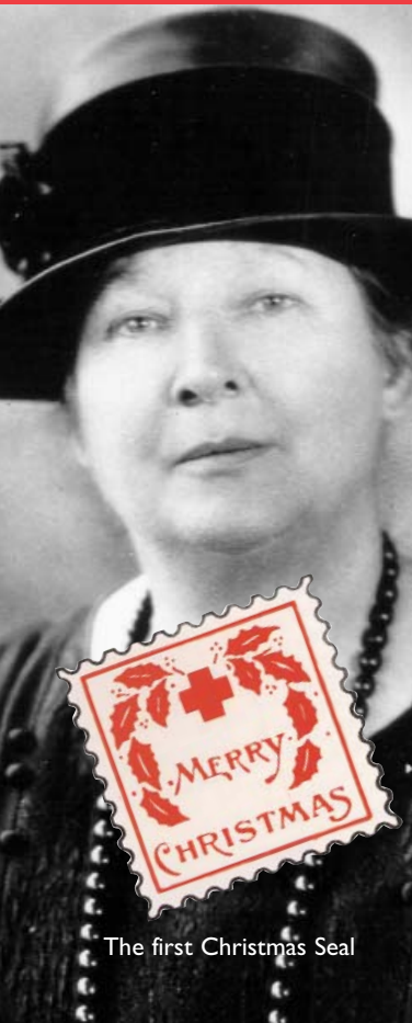
The first Christmas Seal