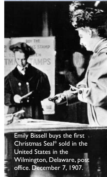
Emily Bissell buys the first Christmas Seal® sold in the United States in the Wilmington, Delaware, post office. December 7, 1907.