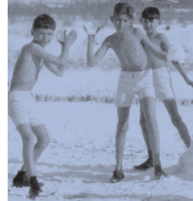
Children at a sanatorium exposed to cold air, as part of the treatment for TB. (Early 1900s)